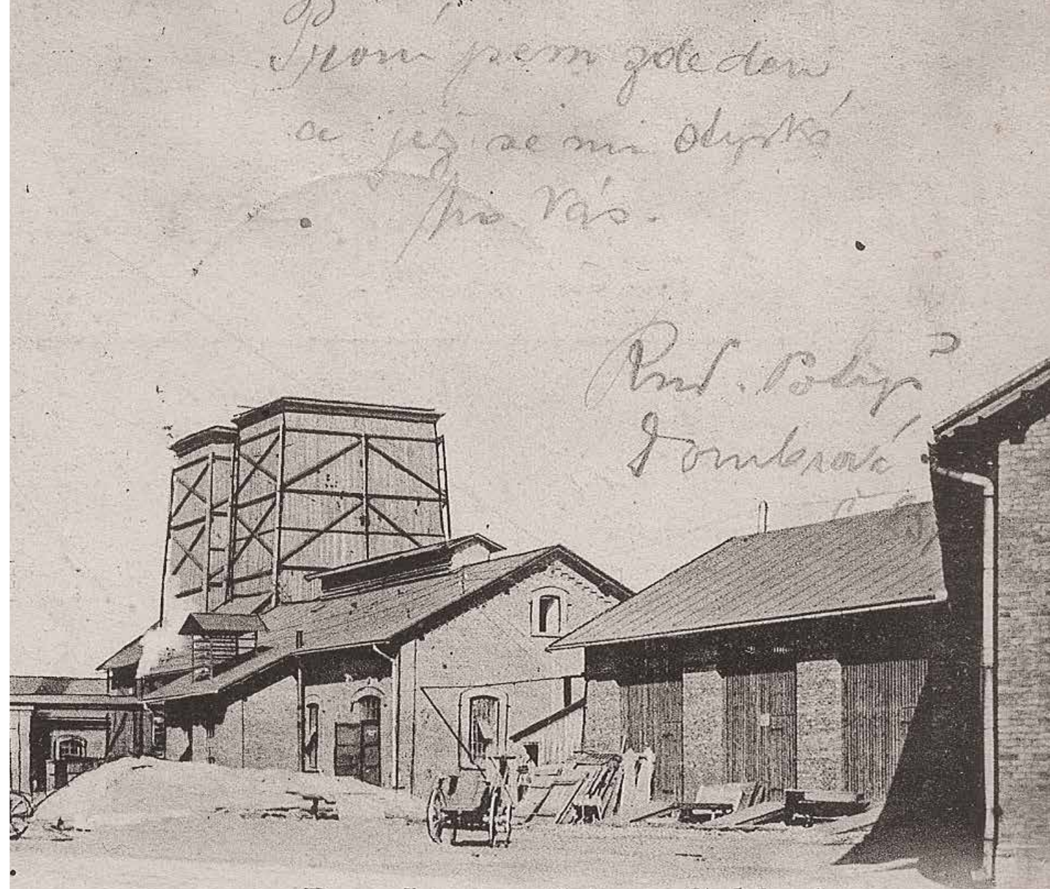
Dombrau, österr. Schlesien. Dąbrowa — Dombrova.