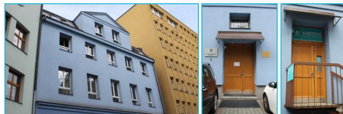
From the left: CIT building, CIT entrance, Card Centre entrance

Students can have their photos taken for the card and pick up their cards at the Card Centre starting in September. The Card Centre is located in the CIT building (Bráfova 5), Room No. 103 (Card Centre).